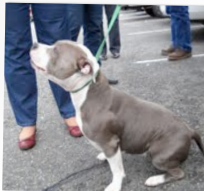
CH TRUGRIP BLUE STAR OF IMPERIUM