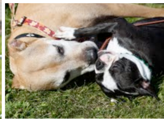
RUMBLE JUMPING (LEFT) AND MOJO JOJO SMOOCHING WITH TEAGAN AT RDO DAY 2009.